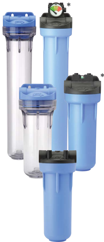
*Shown with differential gauge. Gauges sold separately.

VERSATILE DESIGN ACCEPTS MULTIPLE CARTRIDGE SIZES IN A VARIETY OF APPLICATION SETTINGS